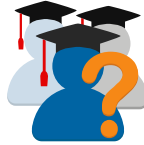
Figure 1: Student-Quiz Icon

The Student-Quiz activity is always represented with Figure 1.