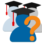
Figure 1: Student-Quiz Icon

To open a Student-Quiz go to your course. The Student-Quiz activity are always represented with Figure 1: Student-Quiz Icon.